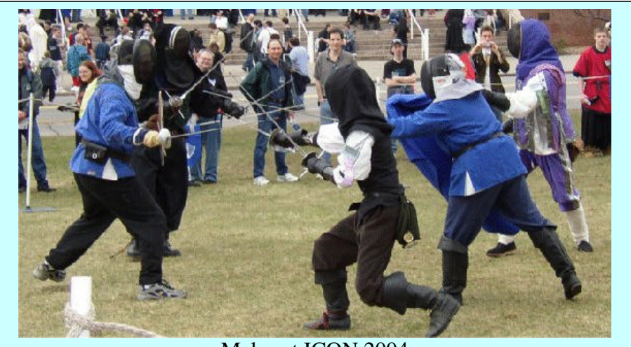
Melee at ICON 2004