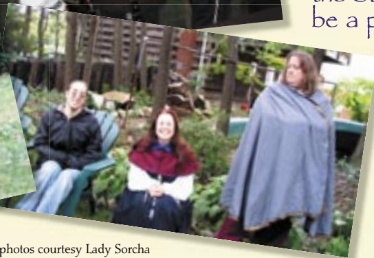
Harvest Commons photos courtesy Lady Sorcha

If you missed the Harvest Commons, you missed a great day of fun food and frolic!